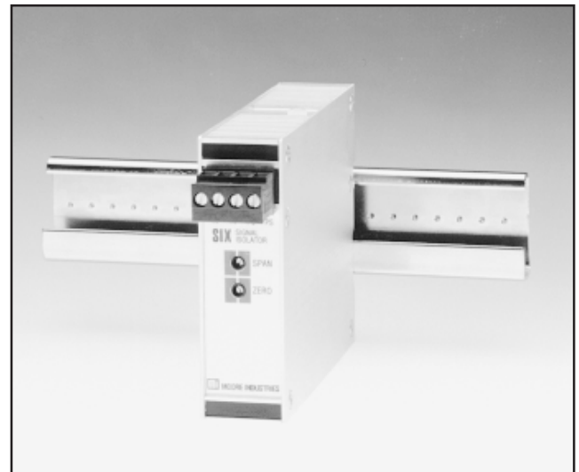
The SIX's DIN-style housing mounts quickly and easily on G-type and Top Hat rails. Removable terminal blocks speed installation and maintenance.